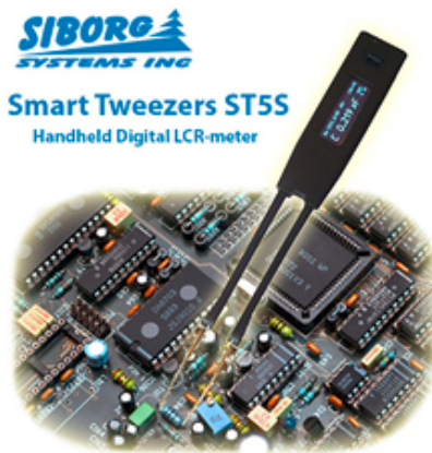
Smart Tweezers ST-5S

The new website launched in Dominican Republic offers electronics and software from Siborg Systems Inc. as well as rental properties.