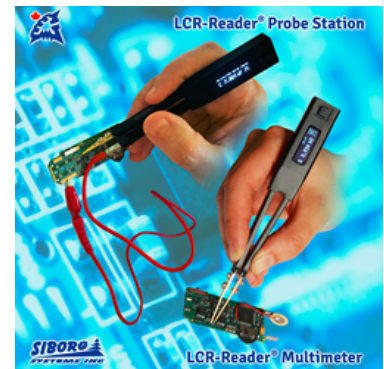
LCR-Reader and the Kelvin Probe Connector

The LCR-Reader has become Siborg's best selling device by offering the same functionality and high accuracy found on Smart Tweezers at a lower-price. The LCR-Reader is controlled with a one-button navigation and offers a 0.5% basic accuracy. In 2016, Siborg finalized a calibration fixture that is able to test the full measurement range of the LCR-Reader. This fixture had been certified by Navair Technologies in Toronto providing the ability to grant NIST traceable calibration for calibrated devices.