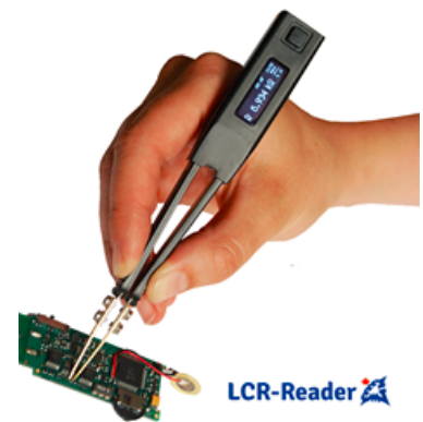
LCR-Reader Professional LCR-meter from Siborg Systems Inc. 1 oz. weight, 1% basic accuracy