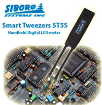
Smart Tweezers ST-5S and LCR-Reader: Features vs Price

LCR-Reader offers ease-of-use for PCB debugging along with an affordable international pricing.