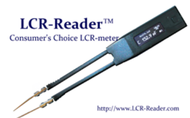
LCR-Reader from Siborg Systems Inc.

Accurate, Fast and Easy-to-Use LCR-meter for Surface Mount Technology