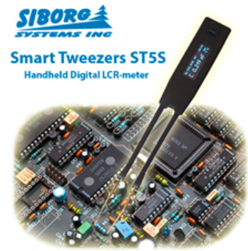
LCR-meter Smart Tweezers ST-5S

Smart Tweezers are an essential tool for quick component evaluations and PCB debugging.