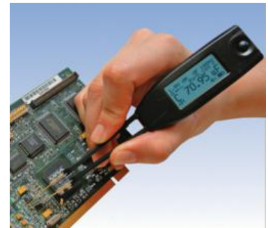
Smart Tweezers LCR-meter simplifies PCB debugging