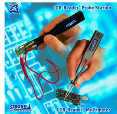
LCR-Reader and the Probe Connector

LCR-Reader Professional and LCR-Reader Professional Plus task kits are pre-bundled boxes that come with LCR-Reader LCR- and ESR-meters, NIST Traceable calibration certificates, spare bent tweezer probes and charger. When this kit is bought through the LCR-Reader Store, it also includes a spare battery.