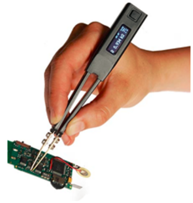
LCR-Reader, the Ultimate LCR-meter for SMT

If you do any work on a PCB, once you use LCR-Reader it becomes an indispensable tool for all applications from manufacturing to repair or maintenance.