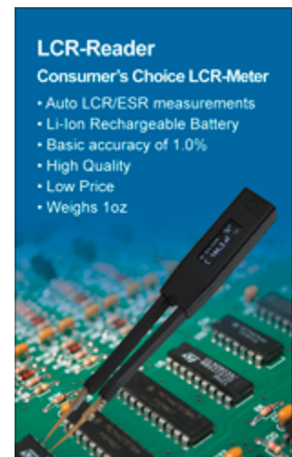
LCR-Reader Akin to Smart Tweezers LCR-meter